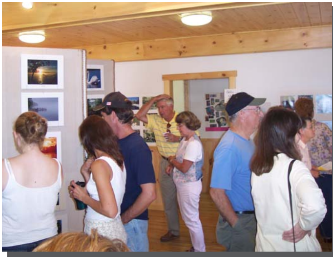
People pondering Viewer's Choice